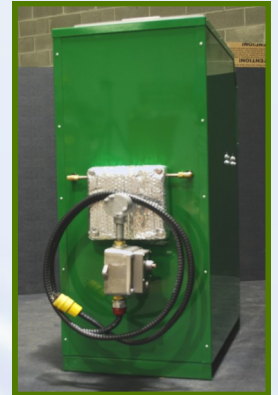
Shown on E300A

A User Reports: "The warm cleaning solution really gets the fluid passageways clean quickly, and my fluid tip, needle and seals stay clean. It's GREAT!"