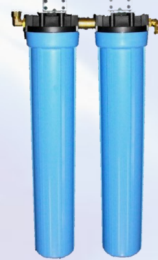
Dual Cartridge System

The ENVIRO E300A, E700M & E800A have a two stage Filter System including a 75 Micron and a 25 Micron Filter providing the best overall paint residue control.