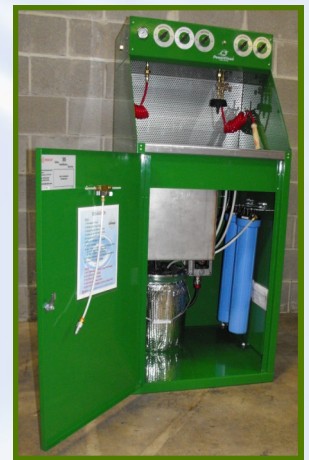
Dual Cartridge System Shown on E800A