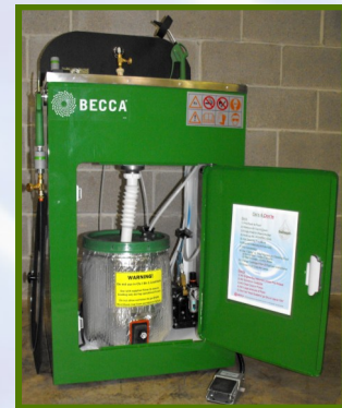
Shown on E100M

Similar to a hot water tank, this system utilizes a heat band and is programmed with a supplied timer to reach the ideal cleaning temperature. This affordable heat option is ideal for units placed outside the paint mix room.