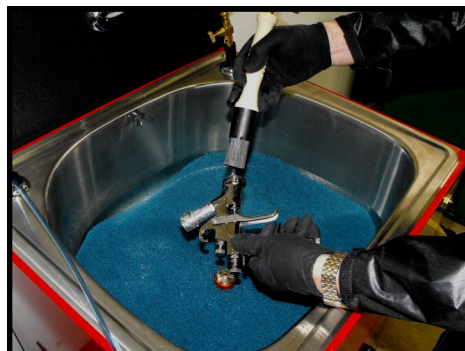
OVERSIZED STAINLESS STEEL BASIN ..... A Spacious Work Area for Easy Use