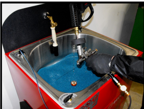
POWERPISTOL™ - Pulsating Fluid... Powerful Cleaning for the Fluid Passageways