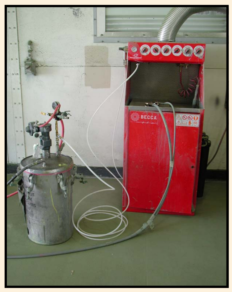
Robins Air Force Base — 30 Gal Pressure Pot System