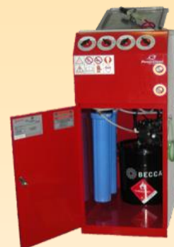
S300A shown with Optional 5 Gal Container