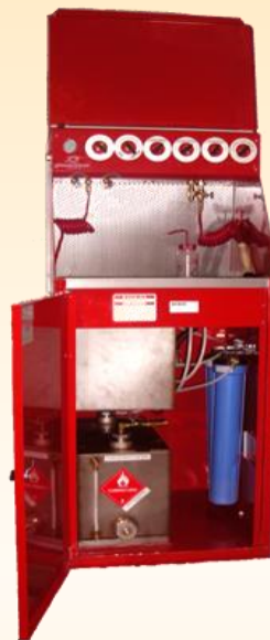
S800A Shown w/ Optional TURBO Pressure Pot & Fluid Line Cleaner, 10 Gal Tank & Cover Door