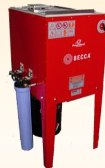
S10A shown with Optional 5 Gal Container