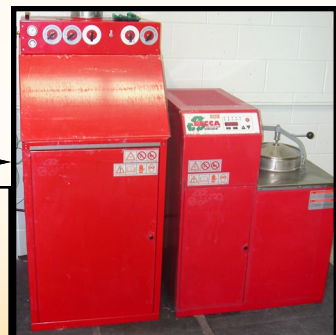
New Application of BECCA Protect™