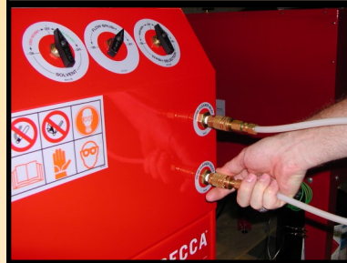
S300A w/ TURBO

Pressure Pot & Fluid Lines can be easily connected to the Turbo System utilizing your operations standard Fluid Quick Disconnects (not supplied)