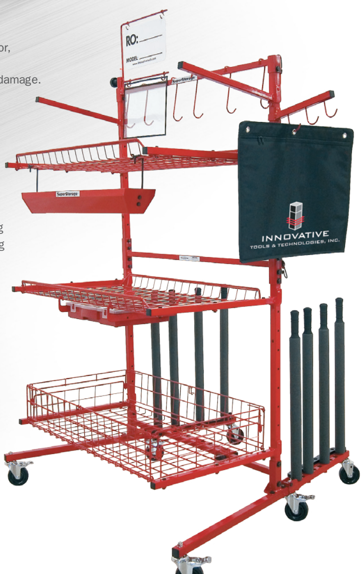
Mirror Bag 24" x 20"