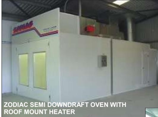
ZODIAC SEMI DOWNDRAFT OVEN WITH ROOF MOUNT HEATER

This style of booth is extremely popular in workshops where heavy vehicles or items on trolleys are to be painted in the booth as the problems of ramps and floor grid load limitations are eliminated. It is also a more cost effective alternative to purchase than the full downdraft version.