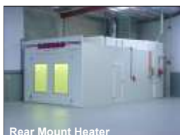
Rear Mount Heater