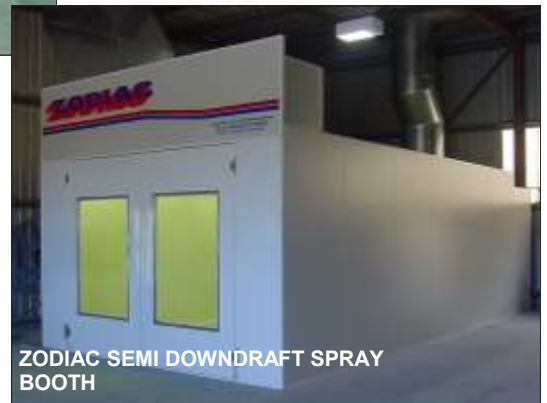
ZODIAC SEMI DOWNDRAFT SPRAY BOOTH