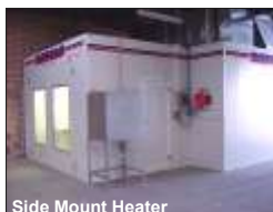
Side Mount Heater