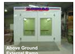
Above Ground External Ramp