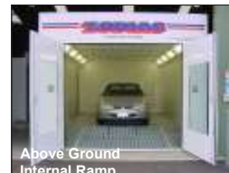
Above Ground Internal Ramp