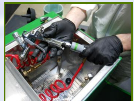
POWERCLEAN™ .... Supply's Compressed Air to the Spray Gun During the Cleaning Process, Protecting the Air Passageways