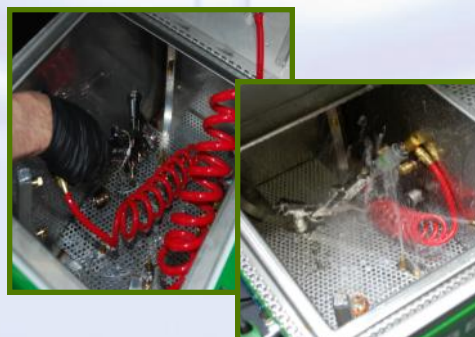
STAINLESS STEEL AUTOMATIC WASH BASIN ..... Maximize Operator Productivity